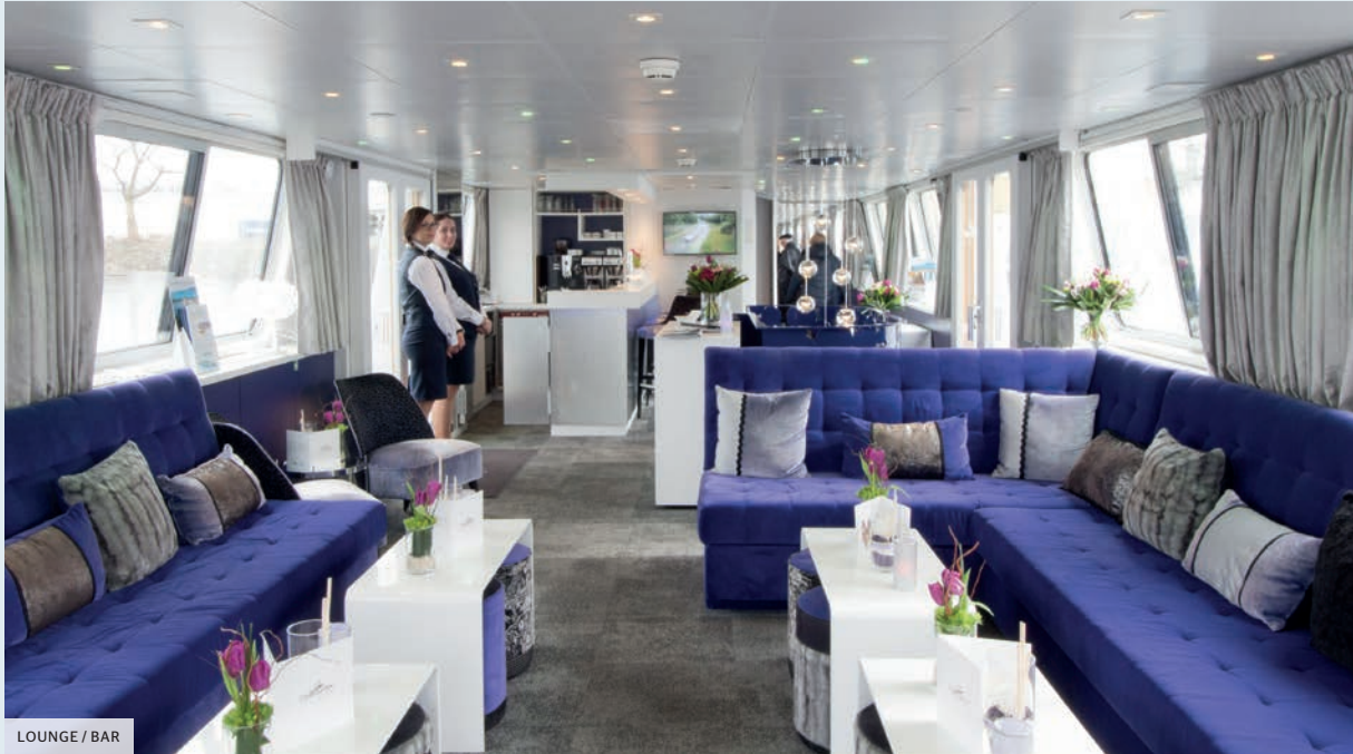
LOUNGE / BAR

A canal barge cruise is an authentic and timeless experience. A privileged moment where you take the time to discover “la douce France” in a different way.